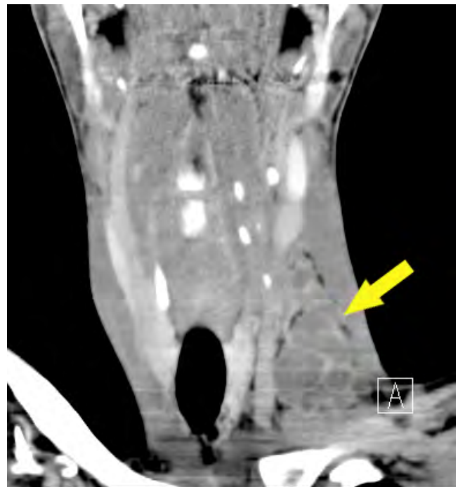
Figure 1. Coronally reformatted CECT of the neck demonstrates multiple areas of necrotic, left supraclavicular lymphadenopathy.

nephrectomy. The tumor had invaded into the renal pelvis, and adjacent lymph nodes were positive for metastasis. On microscopic examination the tumor was a mixed papillary and clear cell renal cell carcinoma, Fuhrman Grade 3, and was later documented to have Xp11 translocation by fluorescence in situ hybridization (FISH) technique. No