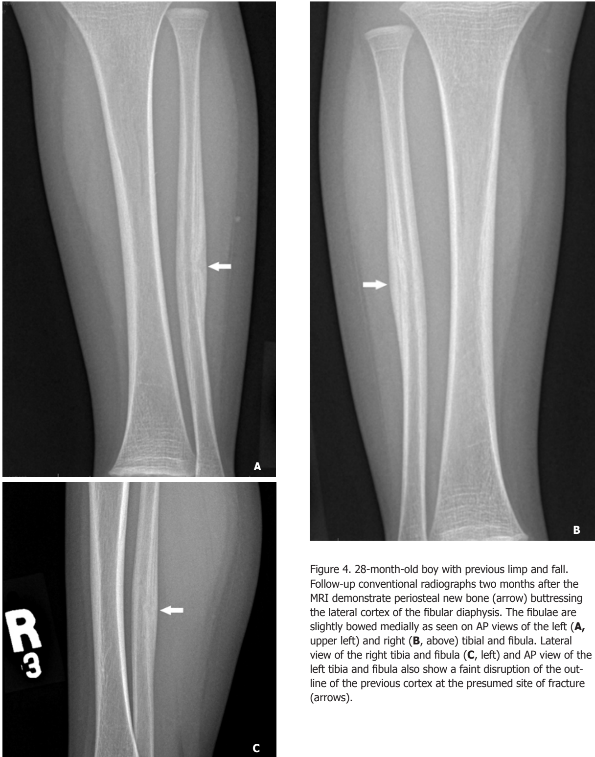
Figure 4. 28-month-old boy with previous limp and fall. Follow-up conventional radiographs two months after the MRI demonstrate periosteal new bone (arrow) buttressing the lateral cortex of the fibular diaphysis. The fibulae are slightly bowed medially as seen on AP views of the left ( A , upper left) and right ( B , above) tibia and fibula. Lateral view of the right tibia and fibula ( C , left) and AP view of the left tibia and fibula also show a faint disruption of the outline of the previous cortex at the presumed site of fracture (arrows).